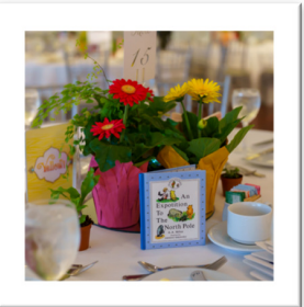
Nancy's inspired vision for a child-themed centerpiece at Turning Leaves, 2022