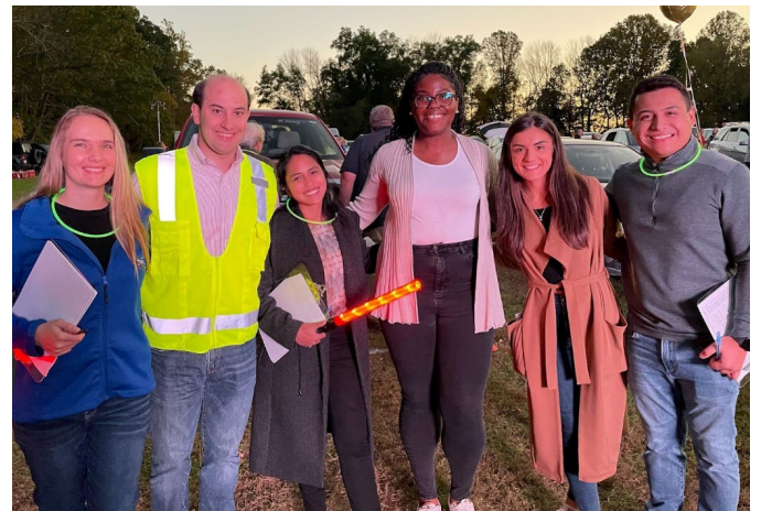
PwC's terrific team helps in so many ways -- even directing traffic at last fall's Turning Leaves event!

We are grateful for this wonderful opportunity to partner with top-tier professionals, one which we could otherwise never afford. Thank you, PwC!