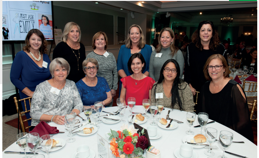
Staff and Trustees of Preschool Place & Kindergarten at 2019 Turning Leaves